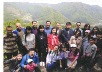
Visits to Afforestation Plant