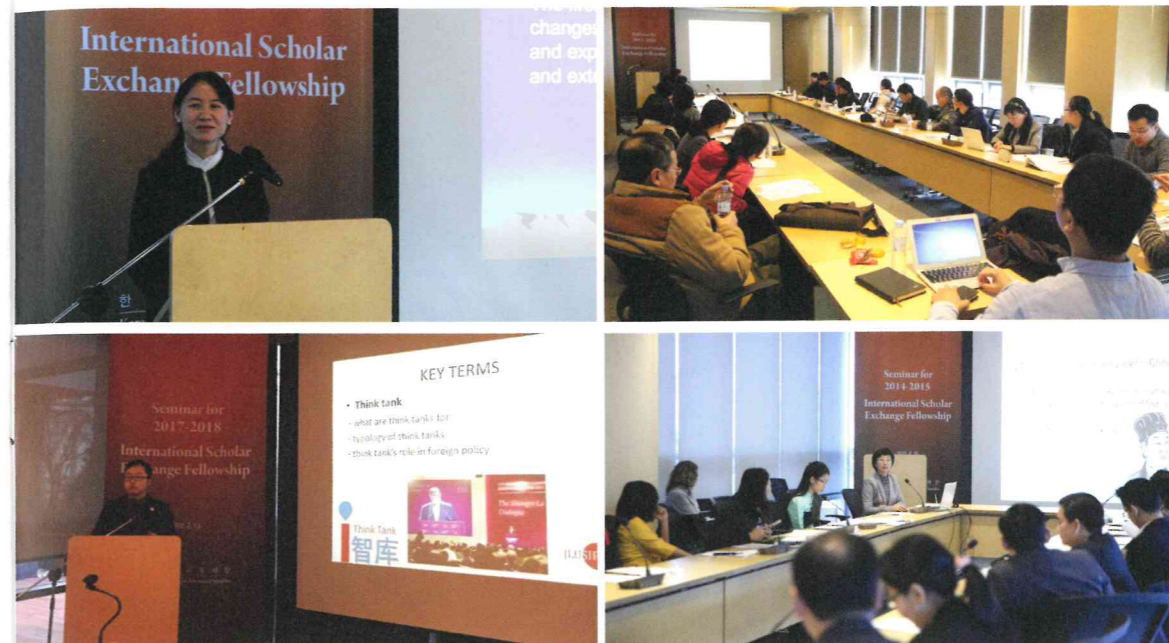
Academic seminars by ISEF fellows

download the form from the KFAS homepage. ("Community" → "Download" → "Letter of Recommendation.doc")