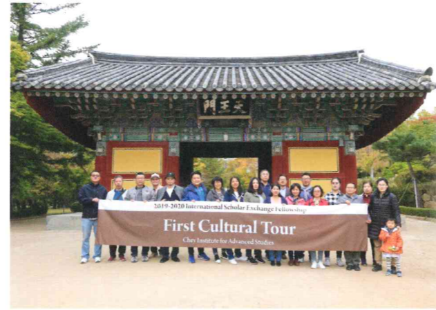
Cultural Tour for the 2019-2020 Fellows

Asia Research Center P.O. Box 11155-4563, 14174, Tehran, Iran T. 98-21-61112185 E. arc@ut.ac.ir