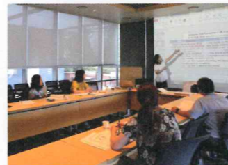
Korean Language Classes