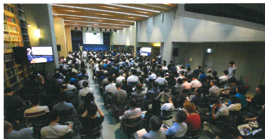
KFAS Conference Hall

- Background: Place your research project in an academic context by referencing major works by other schol-