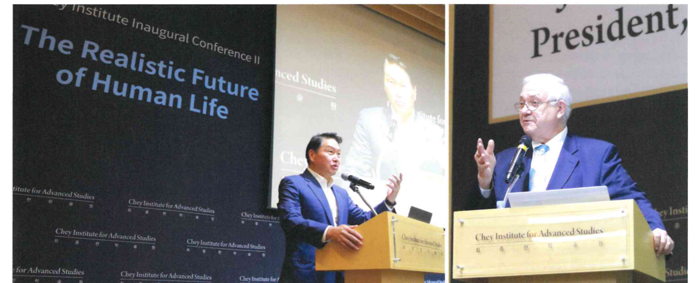
The Chey Institute Scientific Innovation Conference