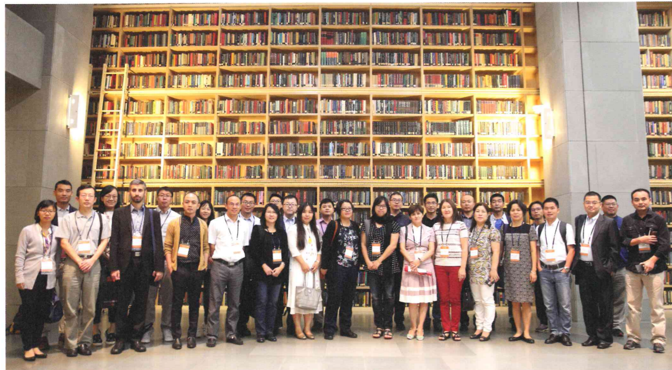
Arrival of ISEF Fellows

The ISEF program provides outstanding scholars with comprehensive research expenses during their stay in Korea, which include round-trip airfare, settlement support, a monthly research stipend, research grant and medical insurance. During their stay in Korea, fellows enjoy full access to the Chey Institute's facilities including seminar rooms and