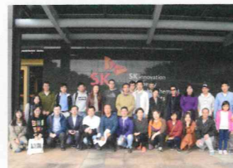
Visits to Industrial Site