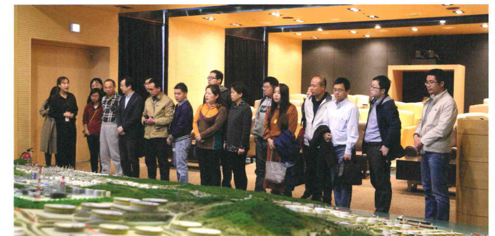
Visit to the SK Energy Ulsan Complex